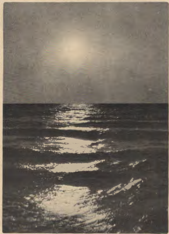
Sunset on Lake Erie